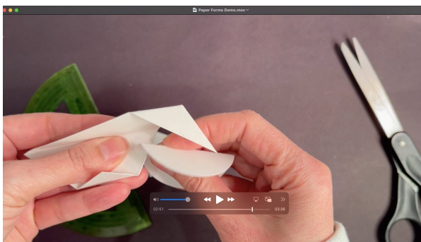
Secondary-Snapshot of video created for demonstration on how to create paper forms.