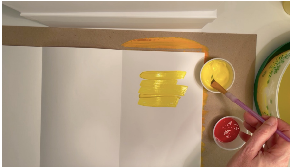
Elementary-Snapshot of video created for painting demonstration.